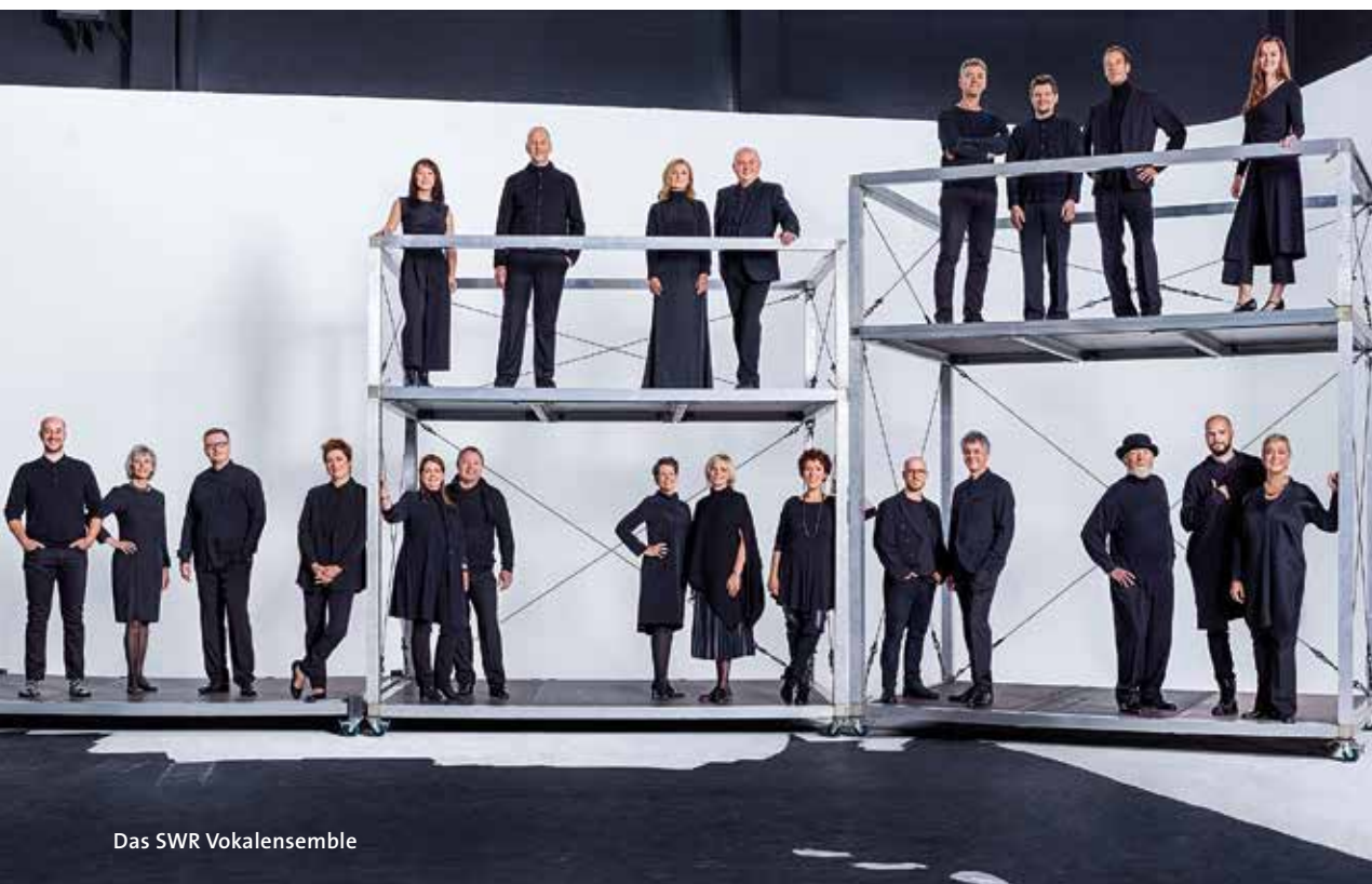
Das SWR Vokalensemble